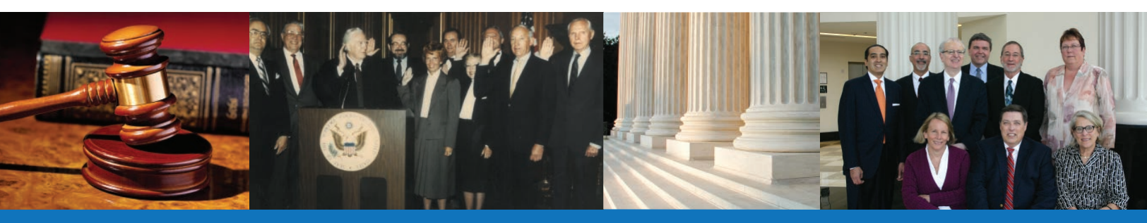
Celebrating 30 Years of Improving the Administration of Justice in Our State Courts